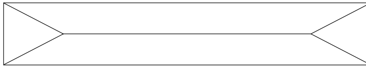
SCORE TILE AS SHOWN